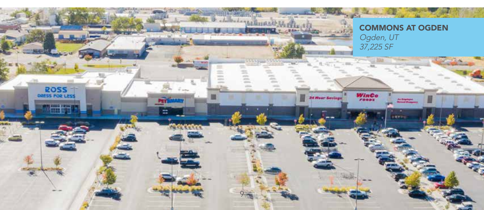
COMMONS AT OGDEN Ogden, UT 37,225 SF