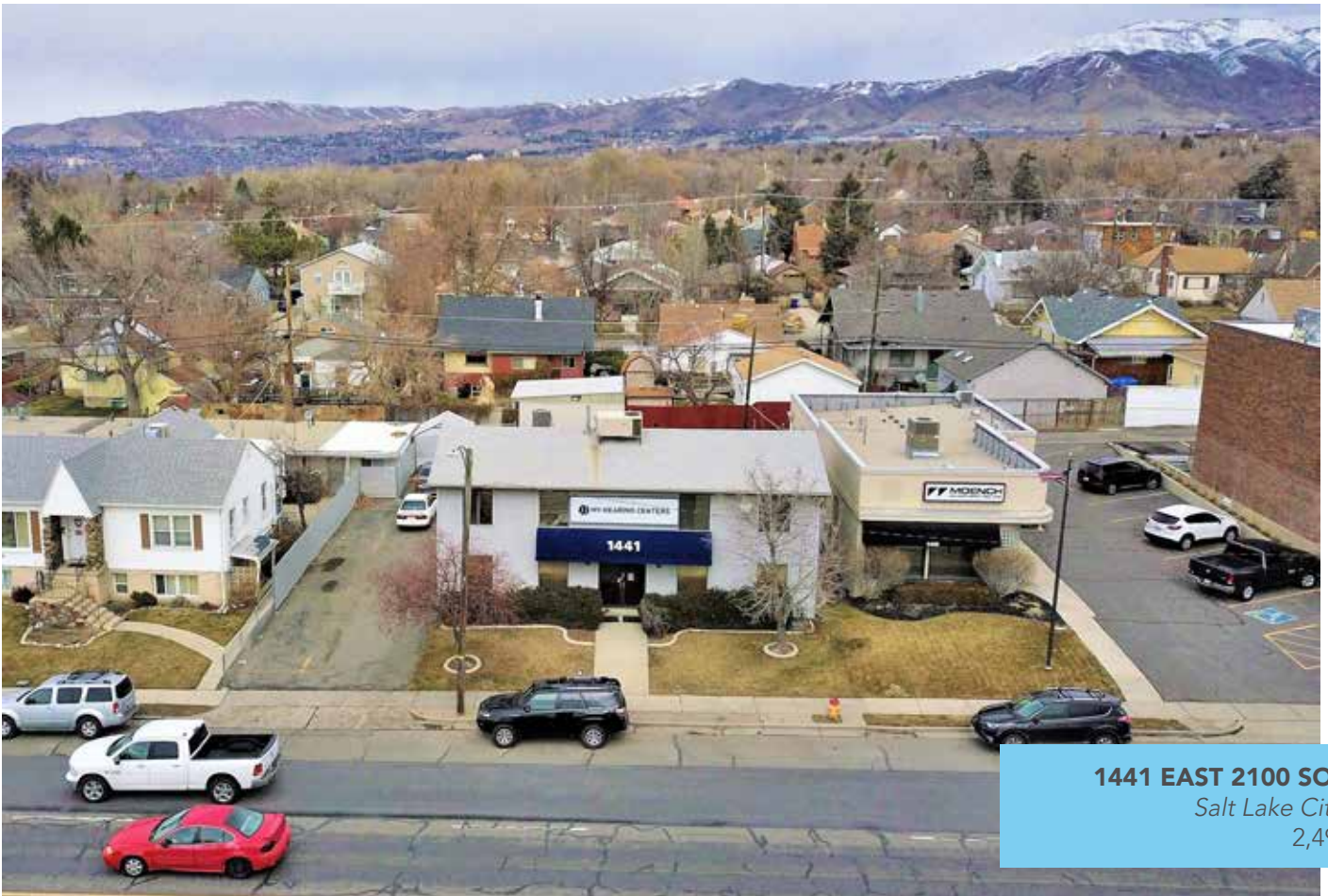
1441 EAST 2100 SOUTH Salt Lake City, UT 2,496 SF