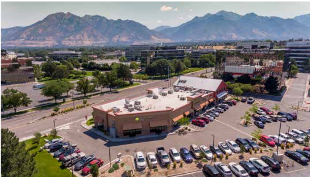
UNION PARK AVENUE Cottonwood Heights, ID 13,180