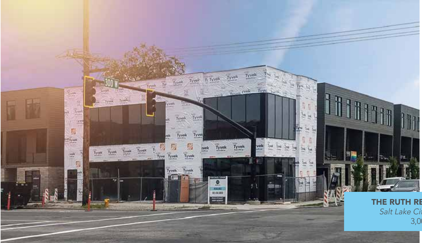
THE RUTH RETAIL Salt Lake City, UT 3,000 SF