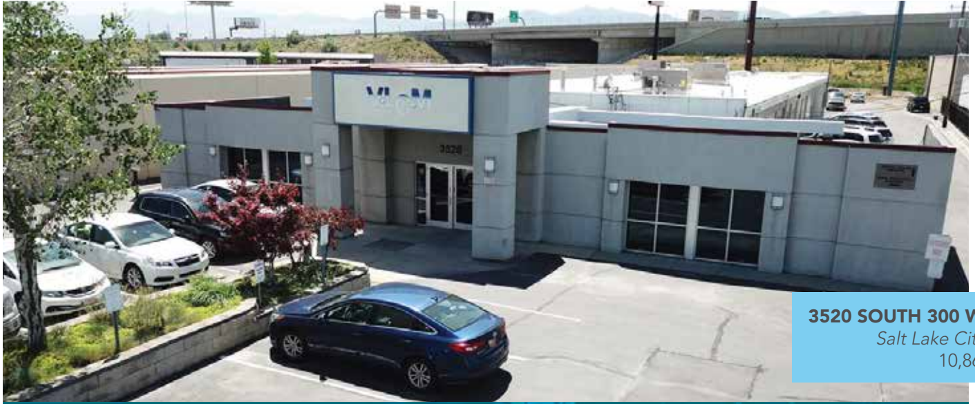
3520 SOUTH 300 WEST Salt Lake City, UT 10,861 SF