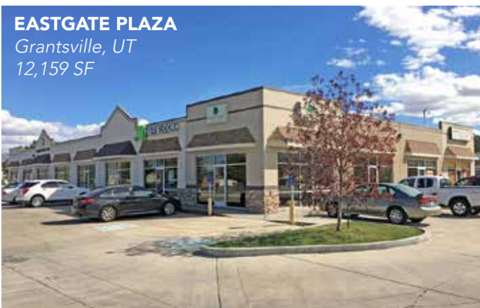
EASTGATE PLAZA Grantsville, UT 12,159 SF