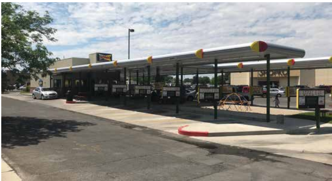
SONIC Spanish Fork, UT 1,423 SF