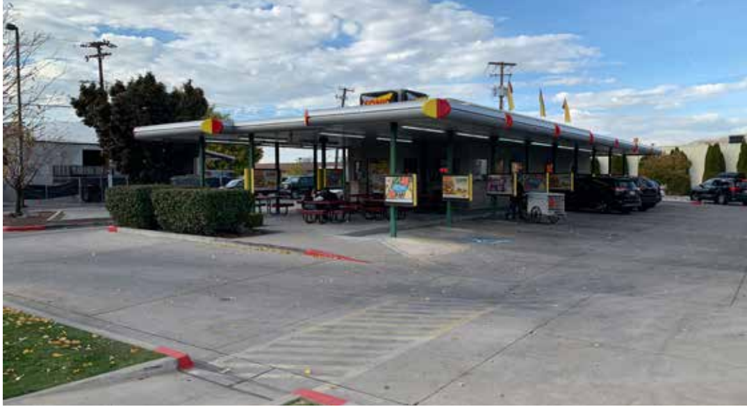
SONIC Salt Lake City, UT 1,512 SF