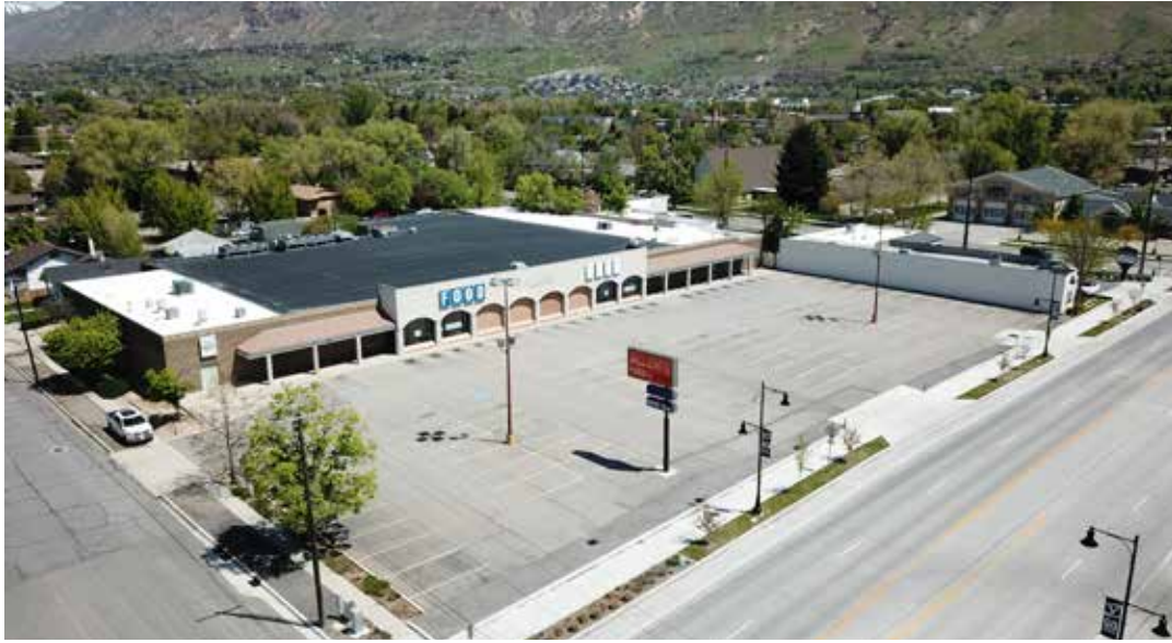
FORMER ALLEN'S Provo, UT 41,726 SF