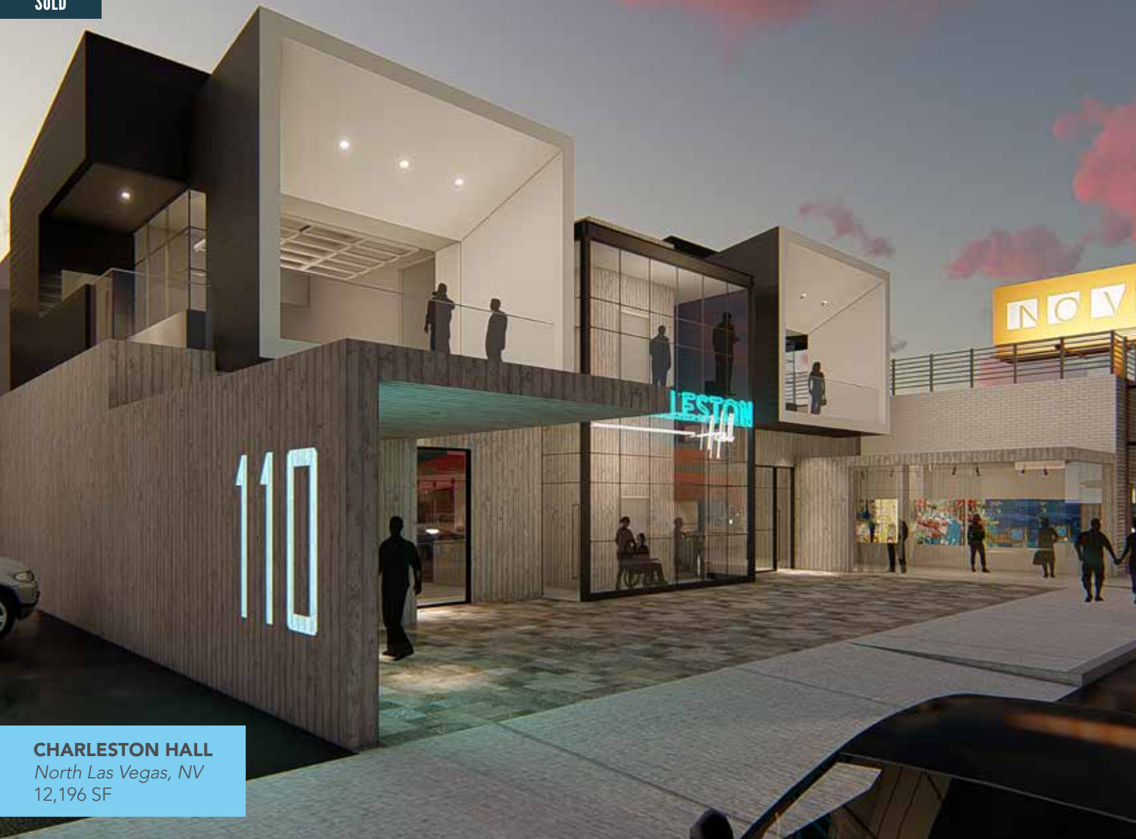
CHARLESTON HALL North Las Vegas, NV 12,196 SF