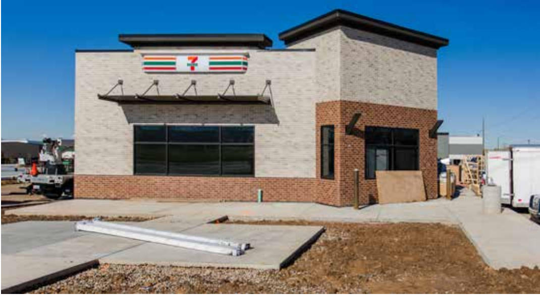
7-ELEVEN Syracuse, UT 3,043 SF