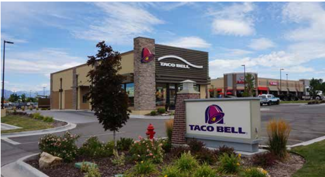
TACO BELL Magna, UT 2,677 SF