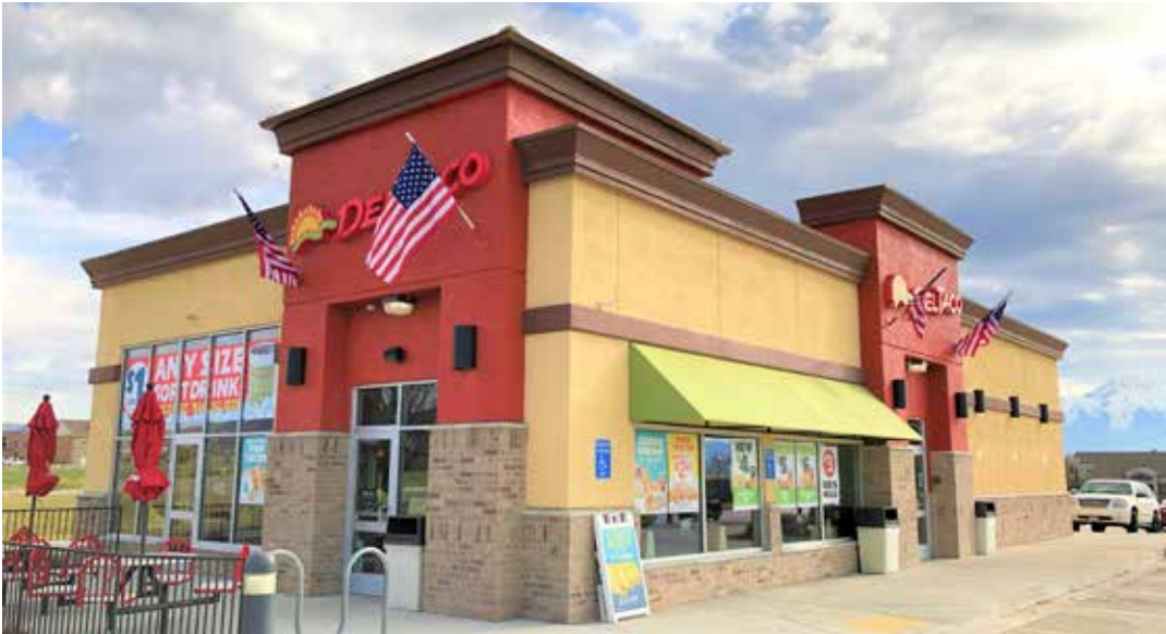
DEL TACO Saratoga Springs, UT 2,800 SF