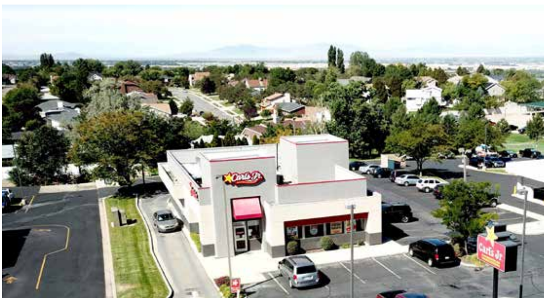
4729 HARRISON Ogden, UT 20,038 SF