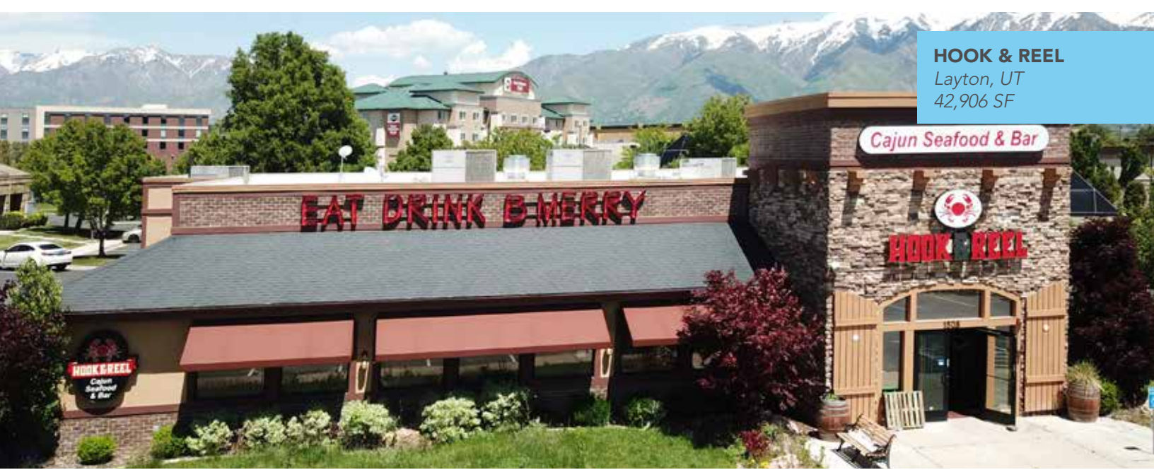
HOOK & REEL Layton, UT 42,906 SF