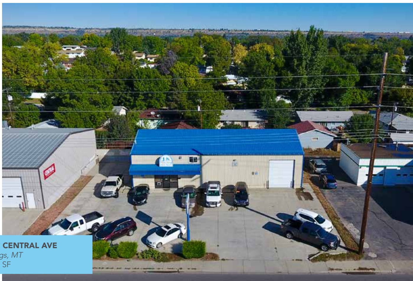
1313 CENTRAL AVE Billings, MT 3,200 SF