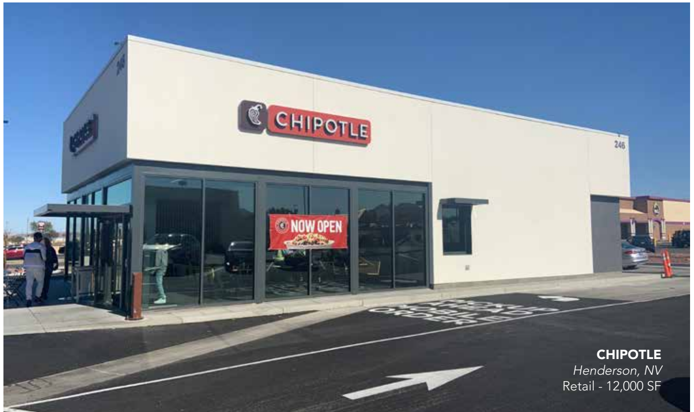
CHIPOTLE Henderson, NV Retail - 12,000 SF