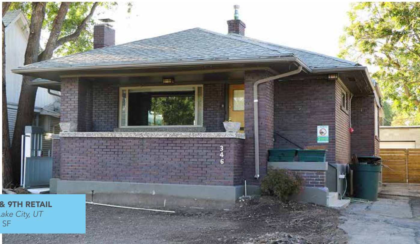
9TH & 9TH RETAIL Salt Lake City, UT 3,500 SF