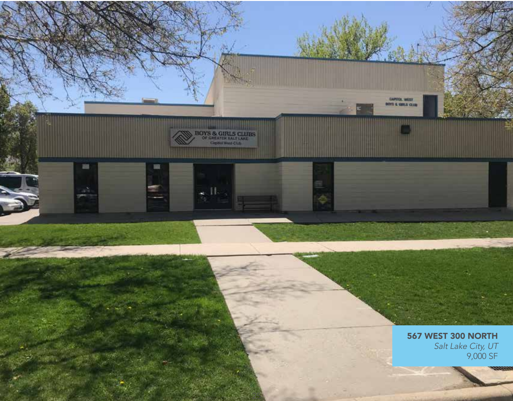
567 WEST 300 NORTH Salt Lake City, UT 9,000 SF