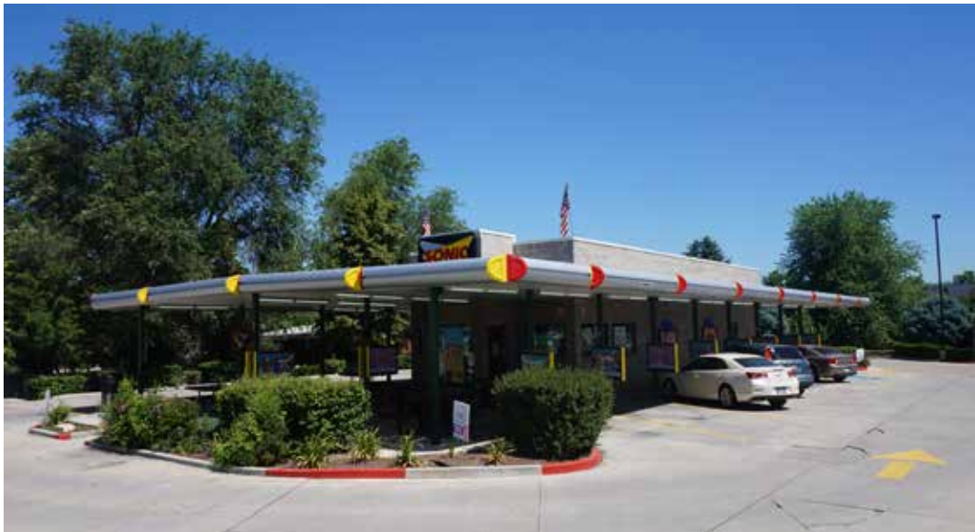
SONIC Midvale, UT 1,512 SF