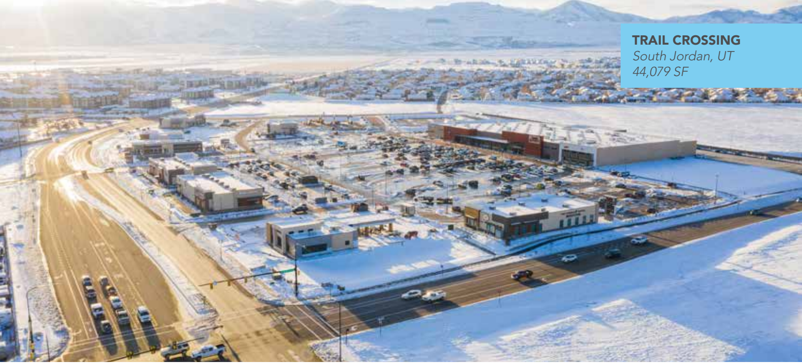
TRAIL CROSSING South Jordan, UT 44,079 SF