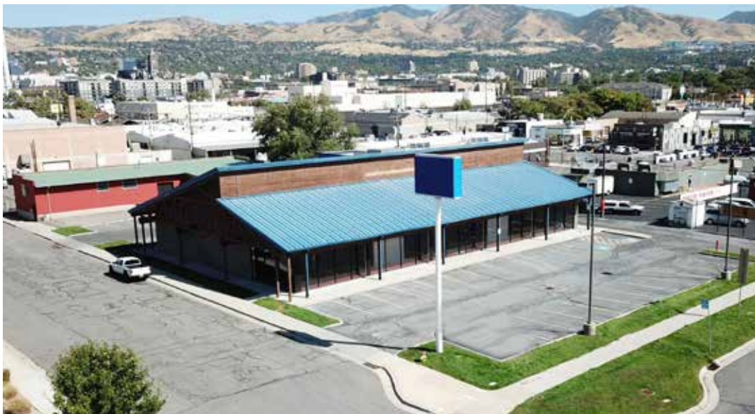
FREESTANDING BUILDING Salt Lake City, UT 34,688 SF