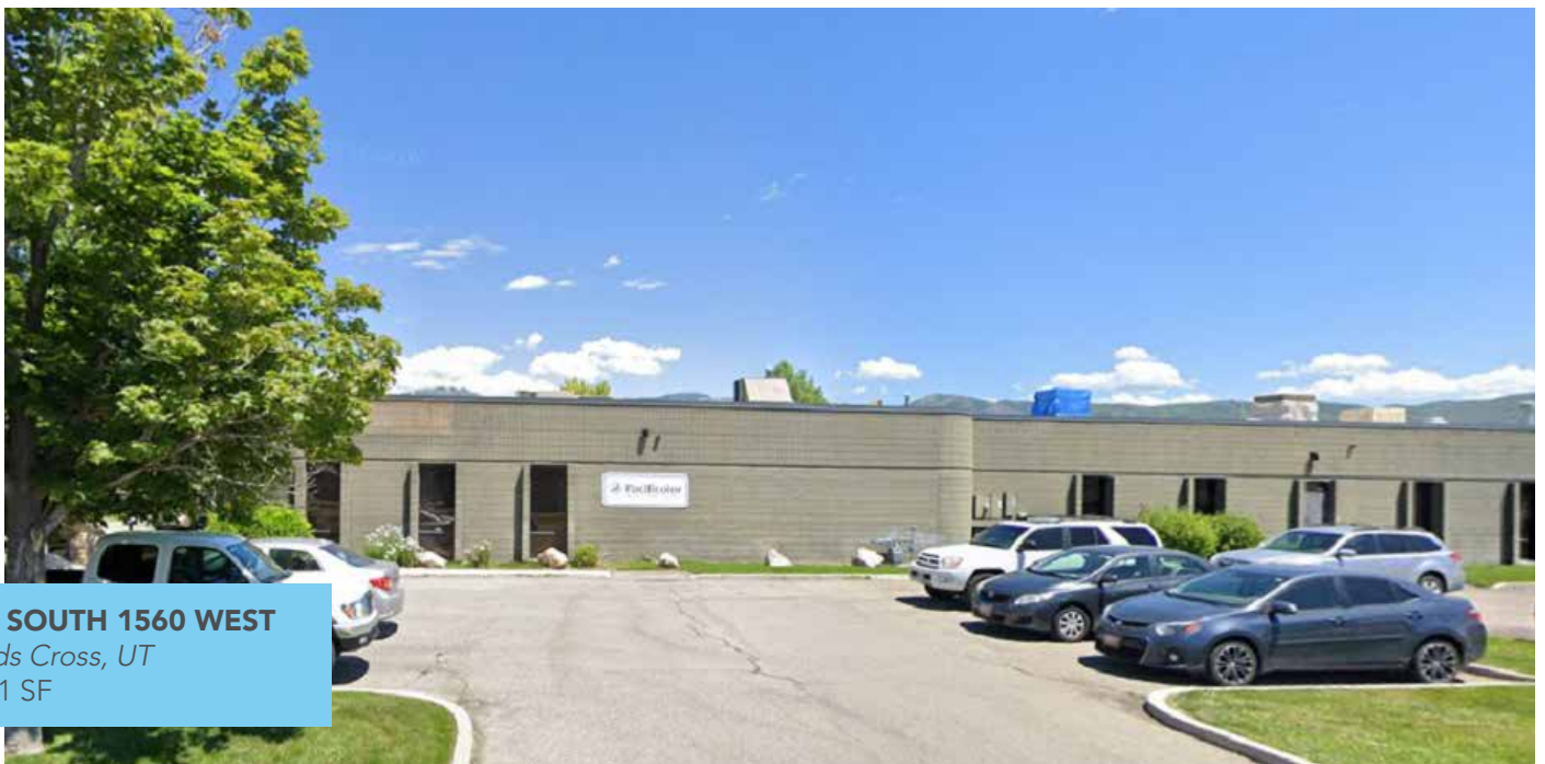
2321 SOUTH 1560 WEST Woods Cross, UT 11,191 SF