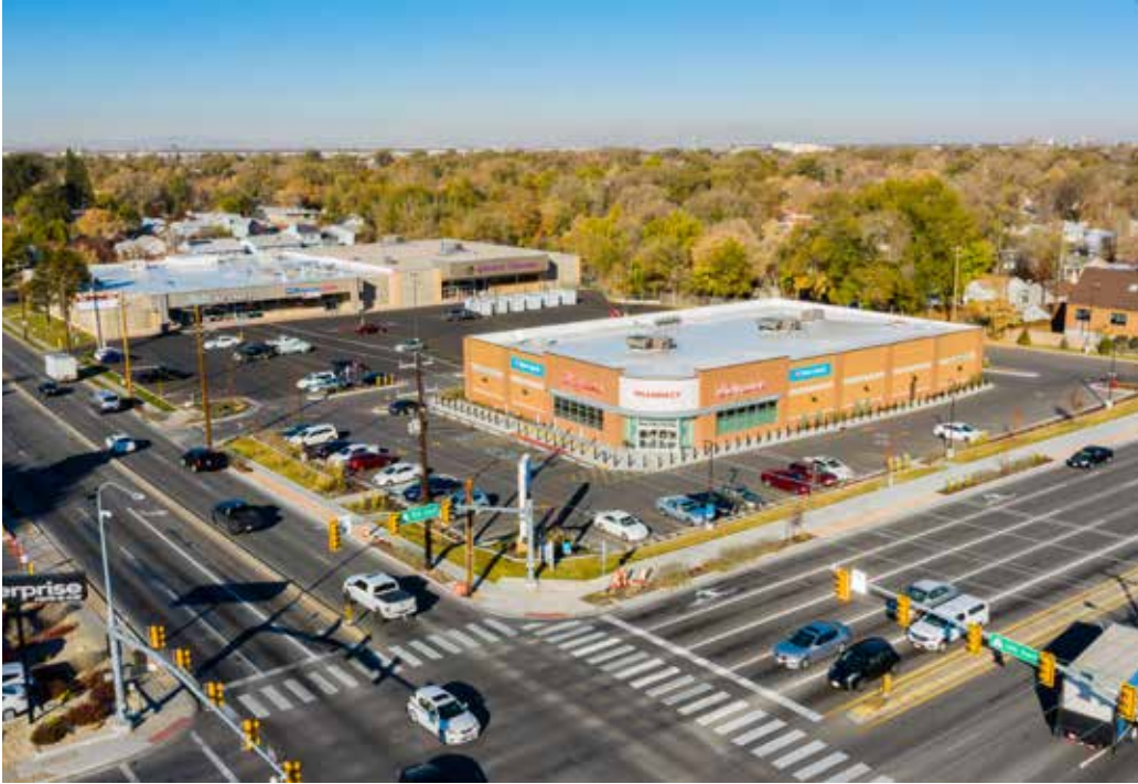
WALGREENS BRICKYARD South Salt Lake, UT 17,185 SF