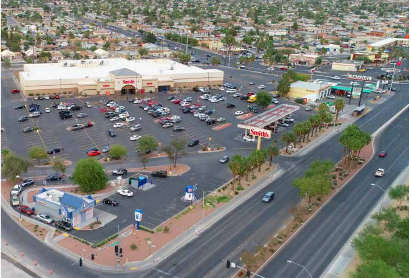
DUTCH BROS Las Vegas, NV 892 SF