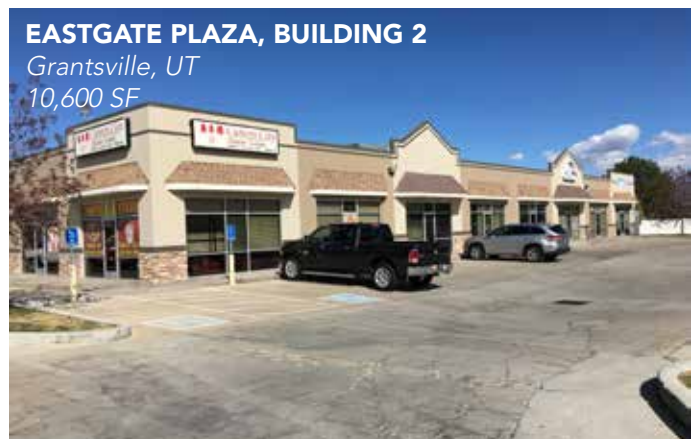
EASTGATE PLAZA, BUILDING 2 Grantsville, UT 10,600 SF